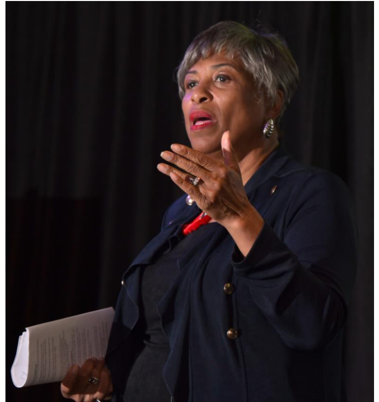
U.S. Congresswoman Brenda Lawrence